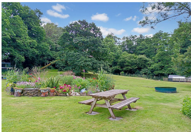
Gardens And Woodland