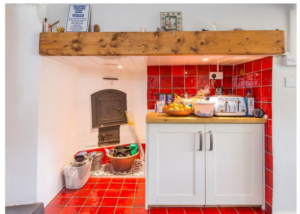
Lovely Old Bread Oven