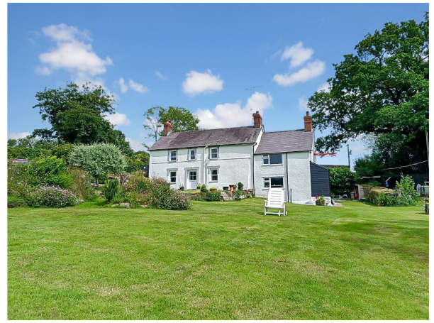
Main House View 2

General Information - Viewings: Strictly by appointment via the agents, The Smallholding Centre or our sister company Houses For Sale in Wales.