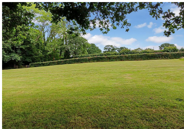
Large Lawns / Paddock Area