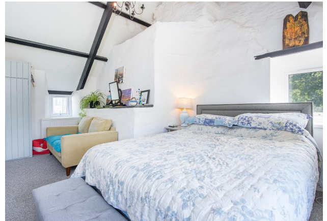
Master Bedroom - View 2