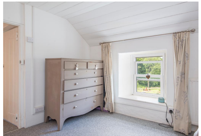
Bedroom 2 - View 2