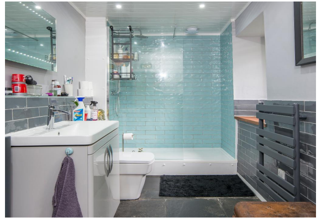
Large Shower Room