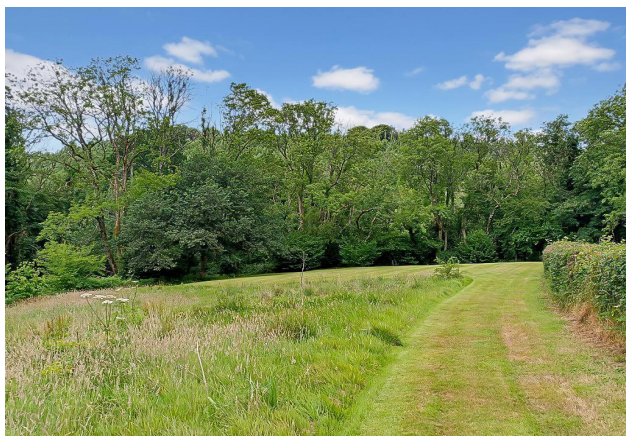
Meadow And Lawns