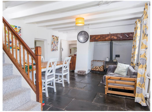
Lounge / Dining Area

Directions - From Newcastle Emlyn, take the A484 towards Cardigan. When you reach Cenarth, turn left onto the B4332 towards Boncath. Proceed to Abercych and just after the bridge, turn left towards Cwmcych/Clydau. With the Nags Head pub on your right, continue along this road for 1 mile until you go over a small bridge on a bend and then take the next right-hand turning. The track to Werngoi is approximately 200 yards further on, on the left-hand side, as denoted by our pointer board. Go up the track and Werngoi is the white house on the right hand side.