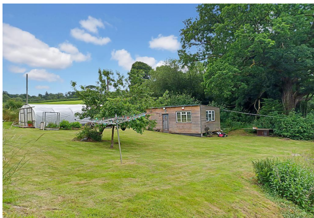
Polytunnel And Workshop