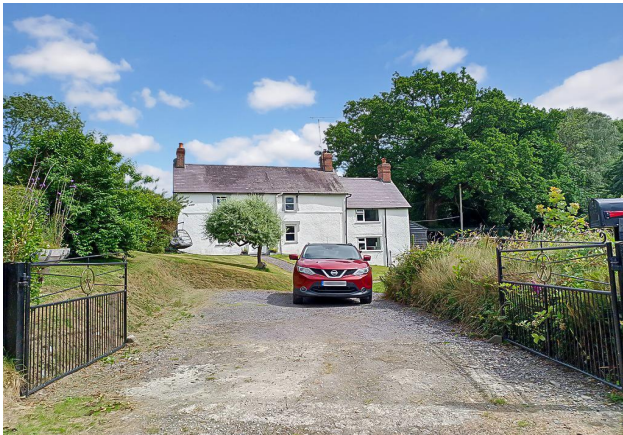
Parking To Front