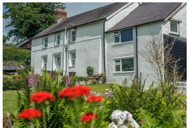
Close Up Main View