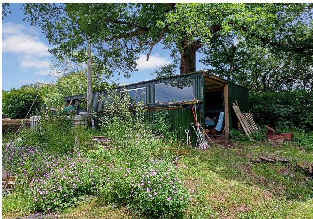
Implement / Tractor Shed