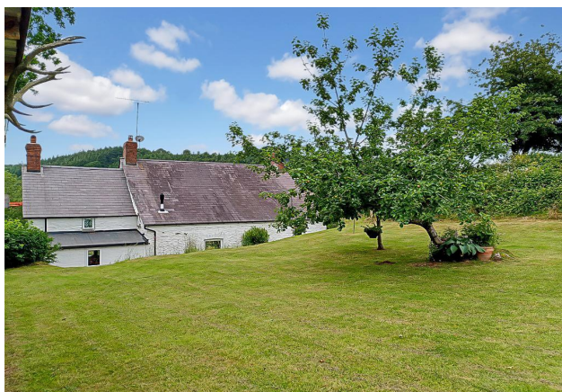
Rear View Of Property