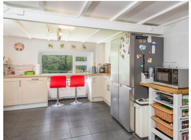
Kitchen - View 2