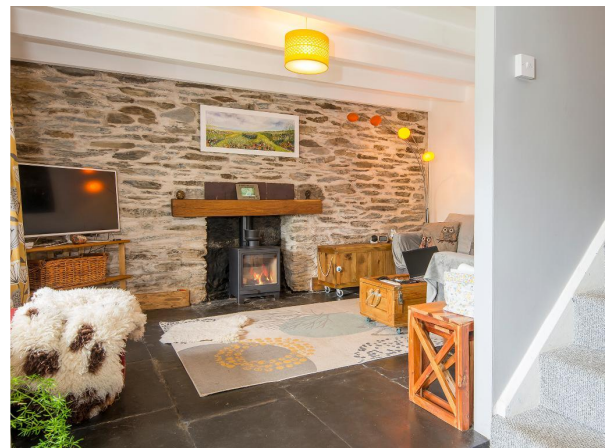
Sitting Room - View 2