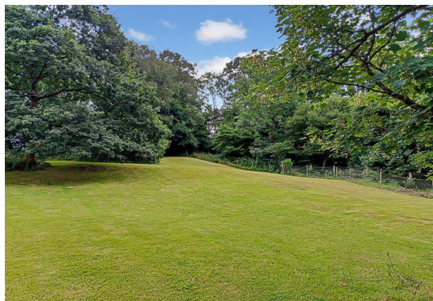
Large Gardens & Wooded Backdrop