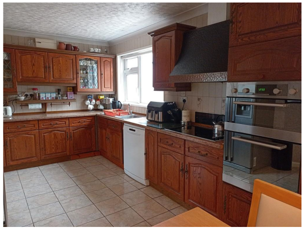
Kitchen / Breakfast Room 1