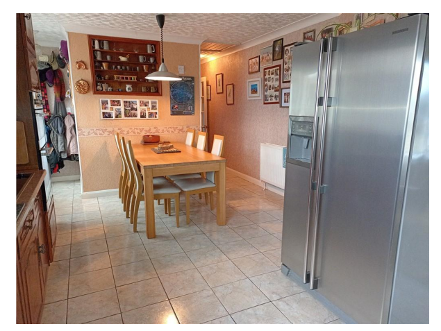
Kitchen / Breakfast Room 3

The Smallholding Centre 1 Cawdor Terrace, Newcastle Emlyn, Carmarthenshire, SA38 9AS