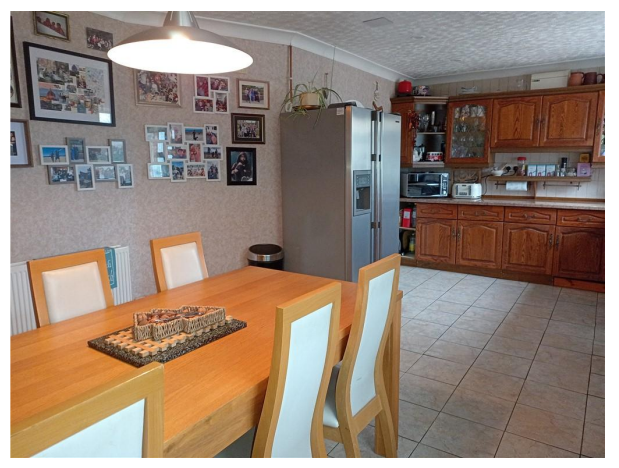
Kitchen / Breakfast Room 2