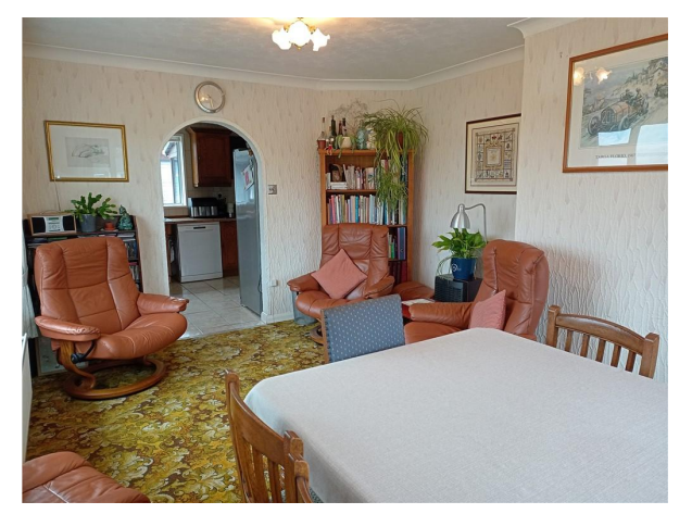
Sitting / Dining Room

Far-reaching view and open farmland are to be had to the left hand side of the property with open farmland to the rear.