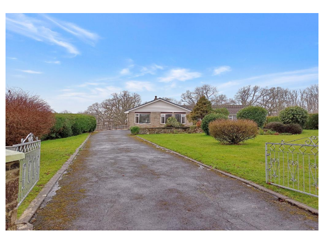
Main View 3