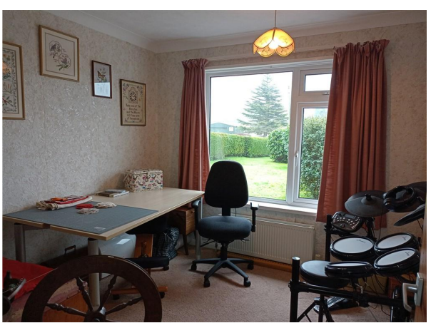
Bedroom Used As Hobby Room