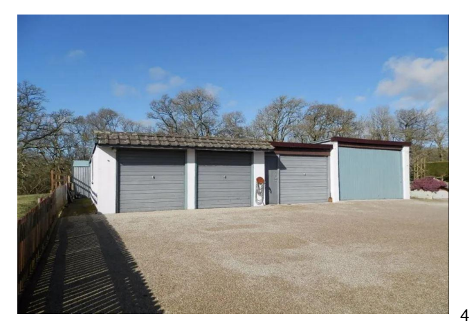
Garages / Workshops