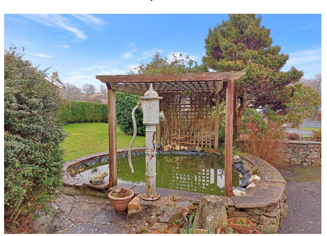
Pond In Front Gardens