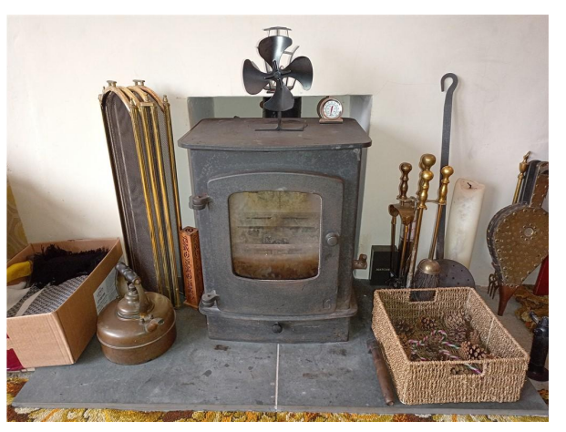
Woodburner In Lounge