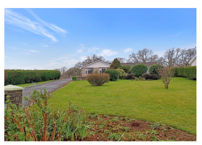
Main View 2