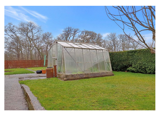
Greenhouse In Rear Gardens