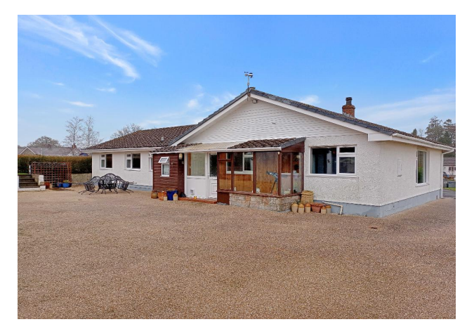
Rear View Of Bungalow