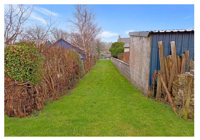
Separate Entrance To Paddock