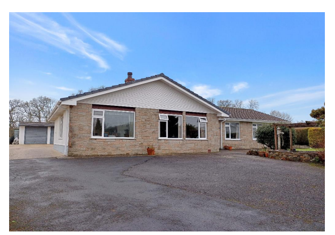
Close Up Front View