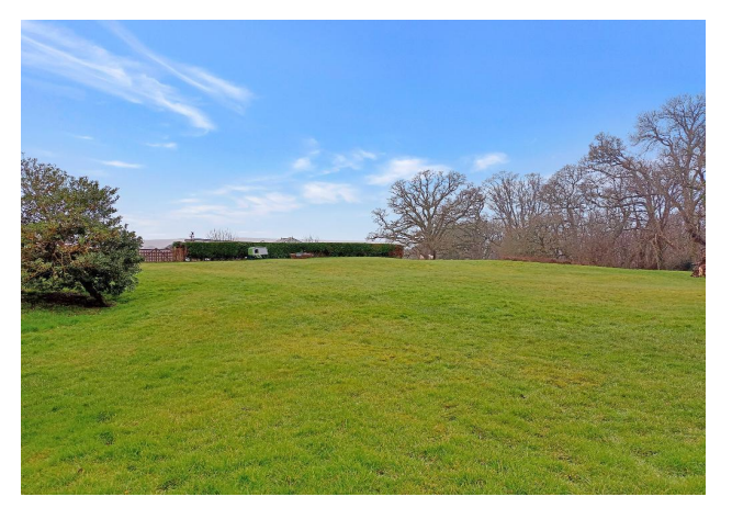
Pony Paddock - View 3