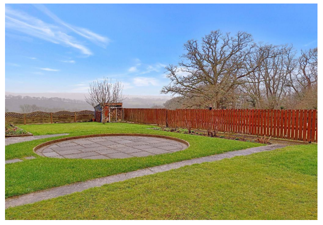
Rear Lawned Gardens