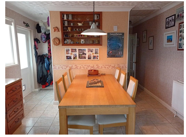
Kitchen / Breakfast Room 4

Google Co-ordinates: 52.038380866459406, -4.397088225802242 What3Words: ///purchaser.blinking.inner