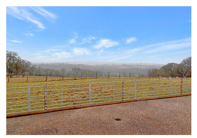
Far Reaching Views