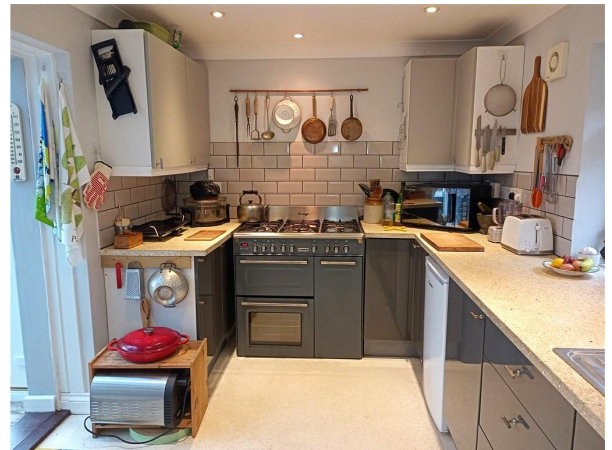
Kitchen - View 1