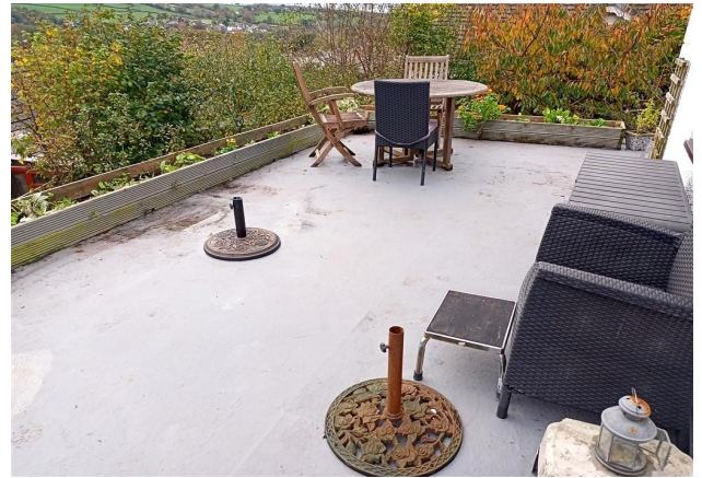
Sun Terrace (Top Of Studio/Workshop)