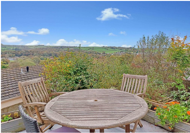
View From Roof Terrace