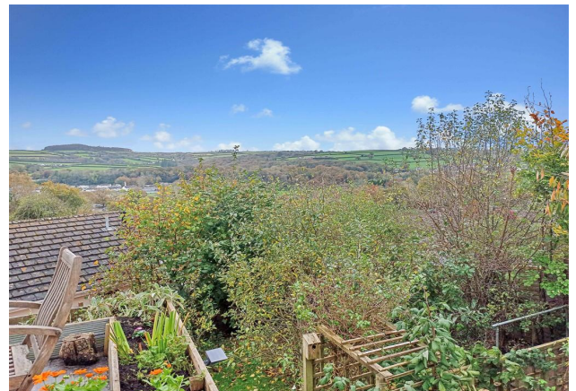
Far Reaching Views Over Emlyn Town