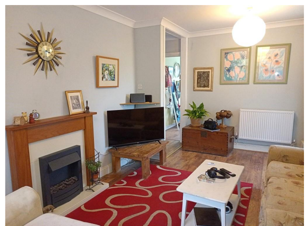
Lounge - View 2