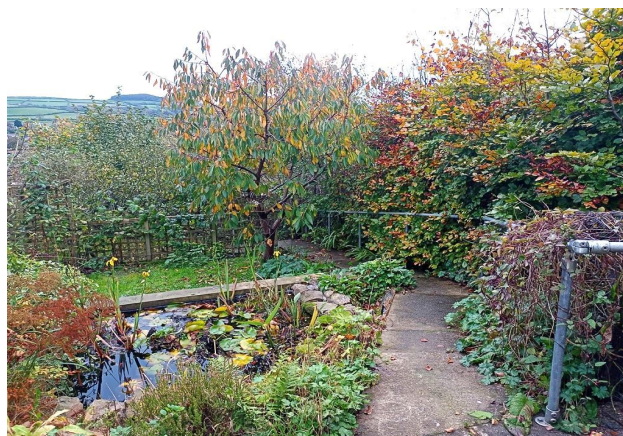
Pond And Rear Gardens