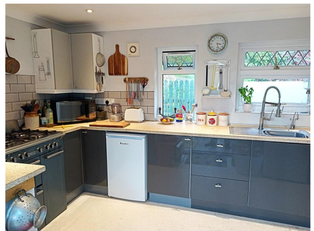
Kitchen - View 2