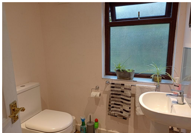
Shower Room In Studio/Workshop