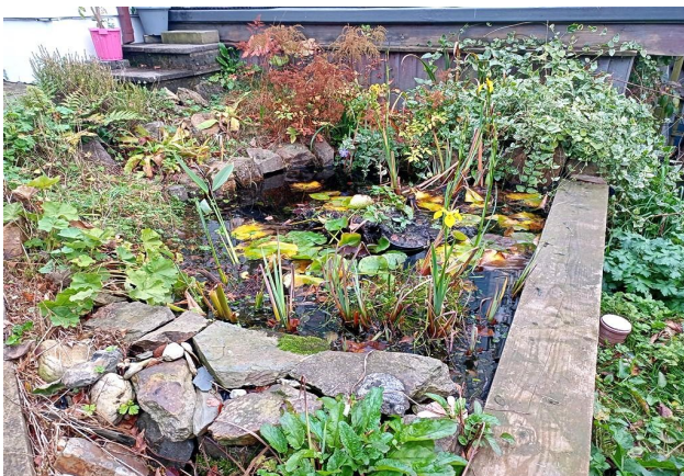
Close Up Of Pond