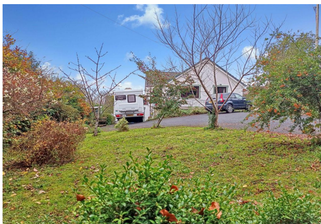
Another View Of Bungalow