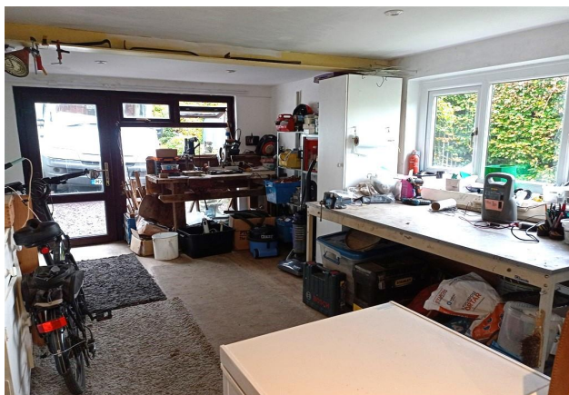
Inside View Of Workshop