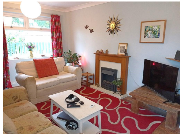
Lounge - View 1