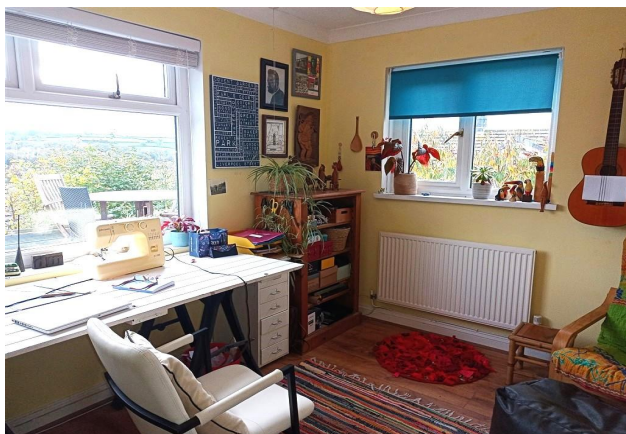
Bedroom 3 (Used As A Hobby Room)