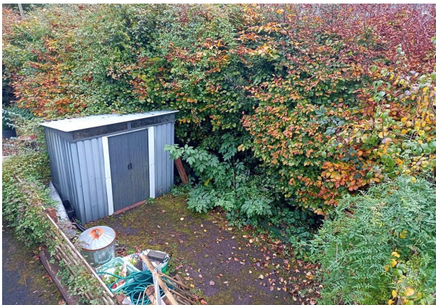
Garden / Tool Shed