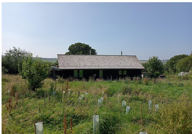
Rear View Of Cabin