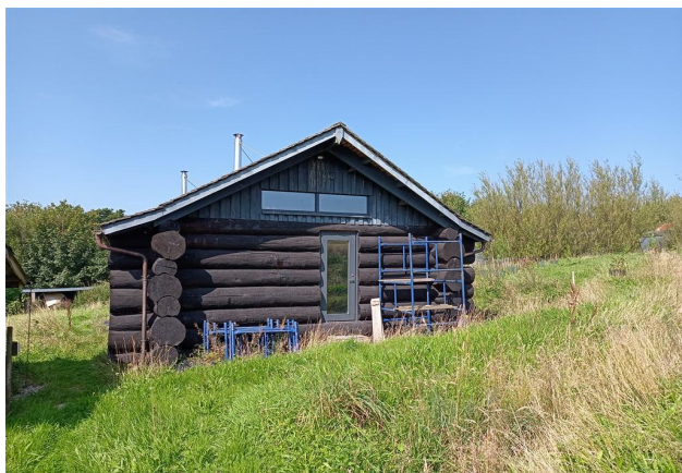
Gable End View Of Cabin