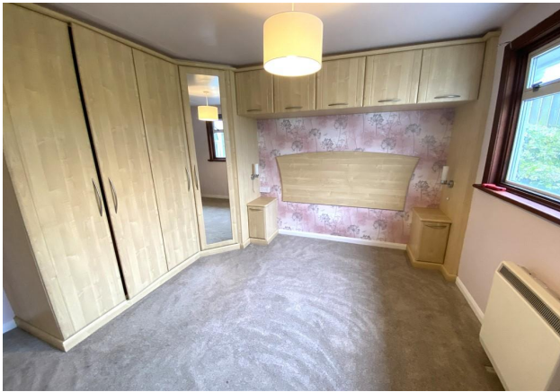
Bedroom 2 - Another View