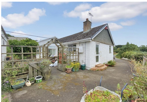
Rear View Of Property