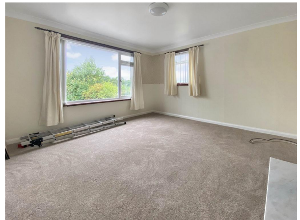
Lounge - Another View