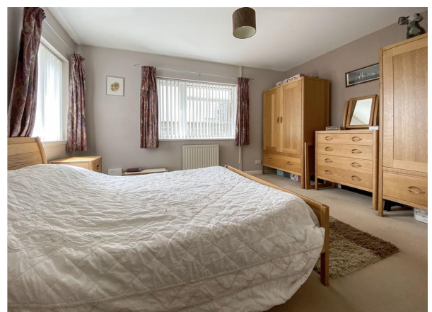
Bedroom 3 - Another View