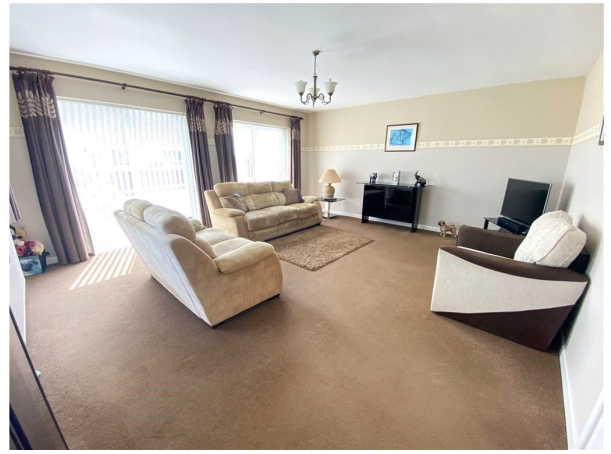
Lounge - Another View

General Information - Viewings: Strictly by appointment via the agents, Houses For Sale in Wales or our sister company, The Smallholding Centre.