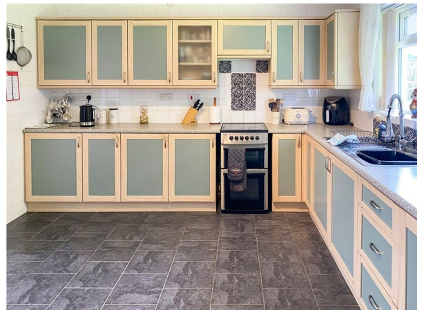
Kitchen - Another View