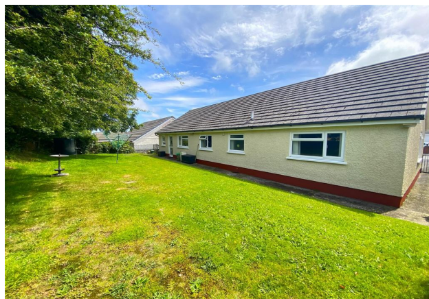
Rear View Of Property