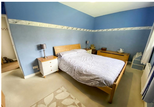
Bedroom 2 - Another View