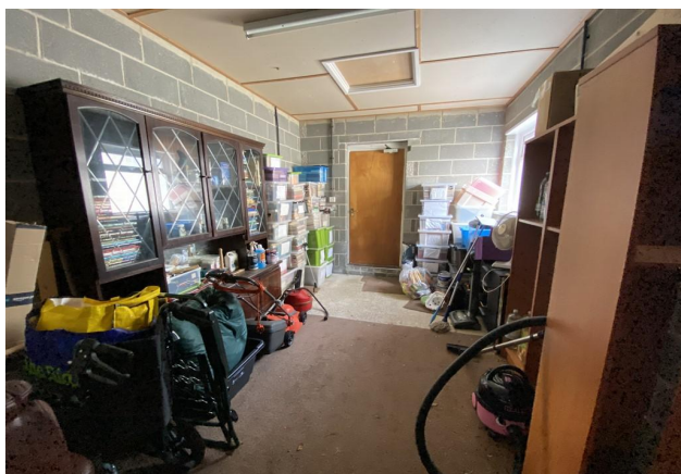
Garage - Another View