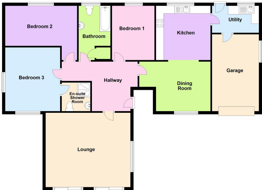
For Identification Purposes Only. Plan produced using PlanUp. 12 Brogorwel