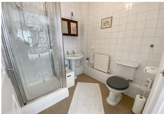
En-suite Shower Room