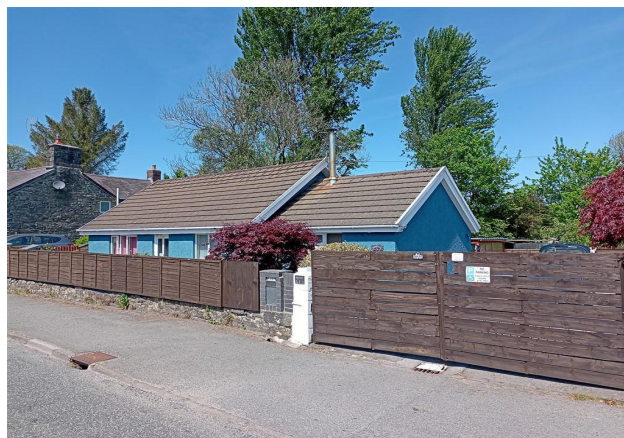
Main Front View