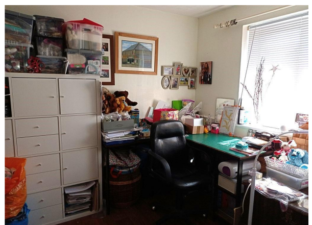
Bedroom 2 - Used As A Hobby Room