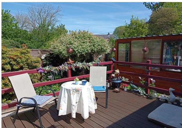
Decking To Rear