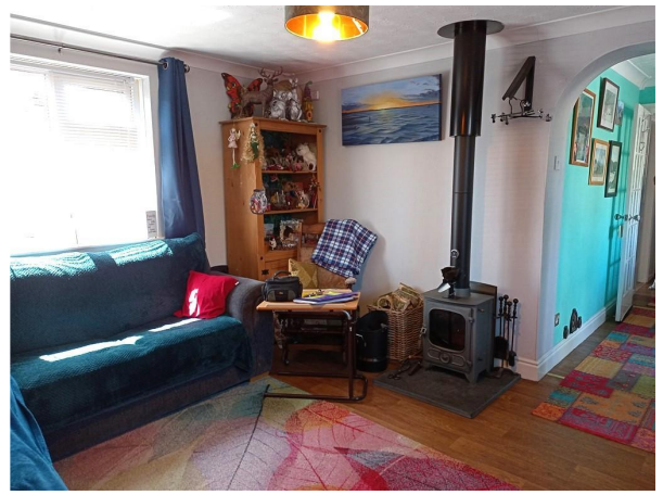
Lounge - View 2