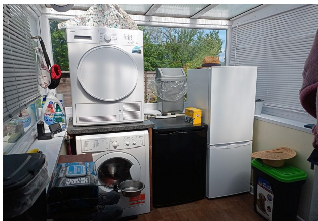
Conservatory / Utility