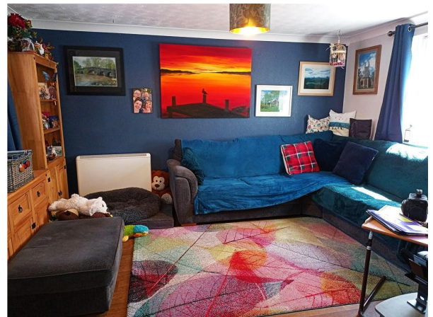
Lounge - View 1