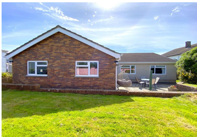
Rear View Of Property