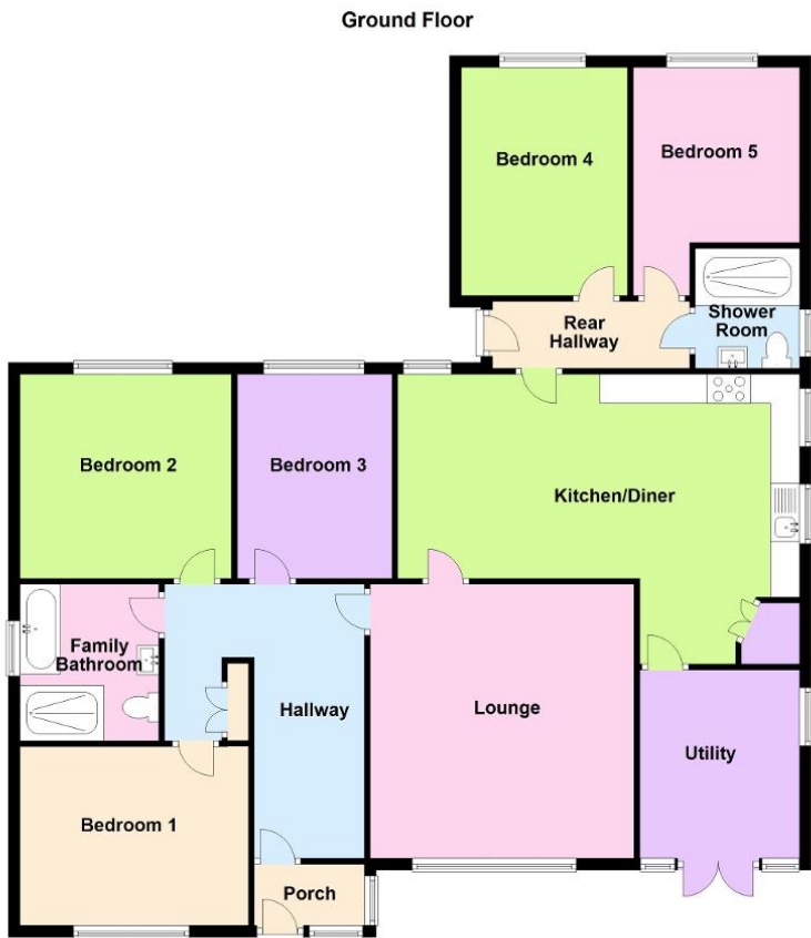
For Identification Purposes Only. Plan produced using PlanUp. Maes Y Ffynnon