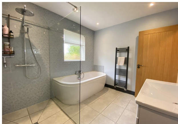
Family Bathroom - Another View