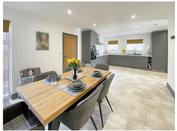
Large Kitchen / Diner

Externally - The property is approached from the lane via a large paved driveway to the front with lawned area and dwarf wall, 3 cherry trees and an electric charging point. There is gated access to either side of the property. To the rear, there is a low-maintenance paved patio area with