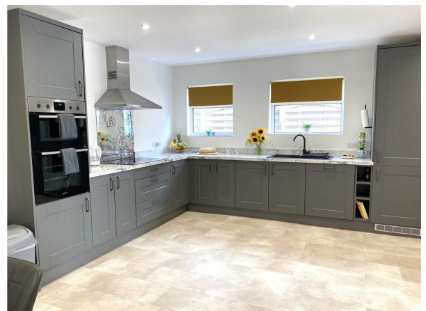
Kitchen - Another View