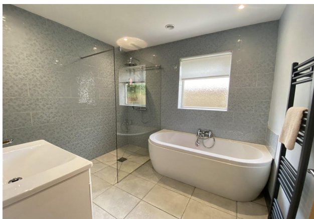
Family Bathroom - Another View