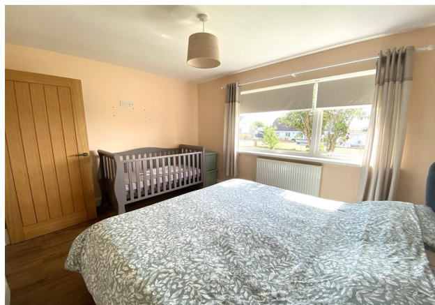
Bedroom 1 - Another View