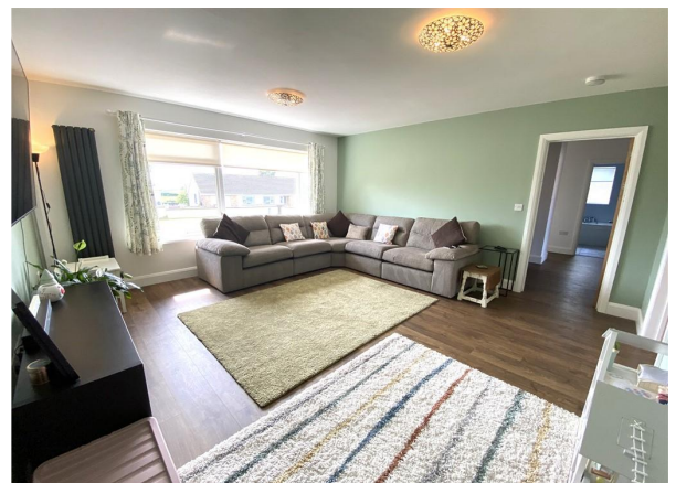
Lounge - Another View