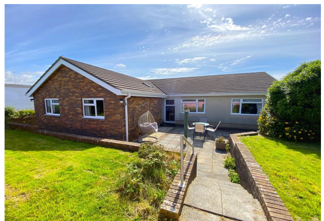
Rear View Of Property