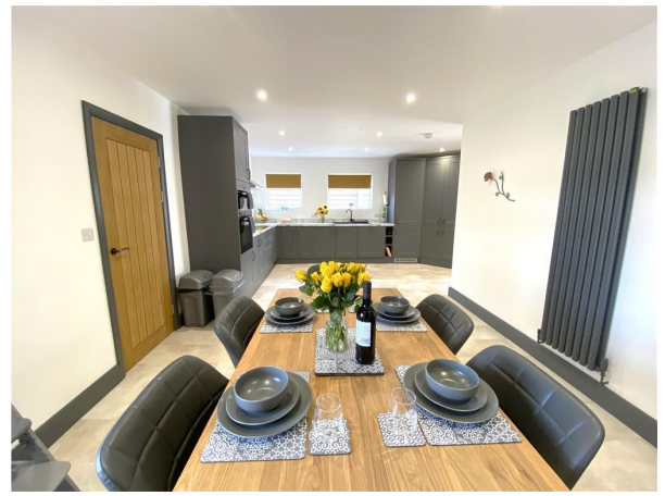
Kitchen / Diner

Google co-ordinates: 52.09337339071442, -4.636236014040817 What3Words: ///tactical.liberated.superbly