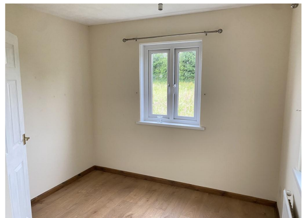
Bedroom 3 - Another View