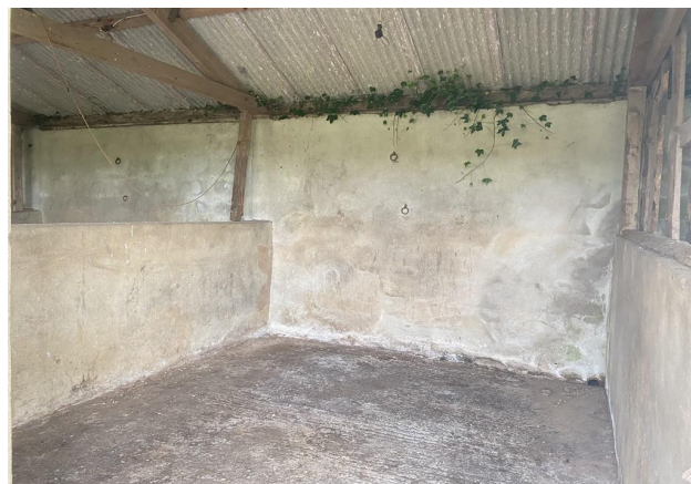
One Of 5 Stables