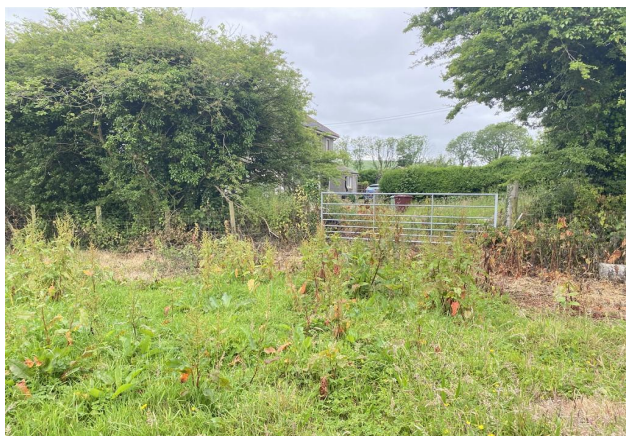
Road Access Into Fields