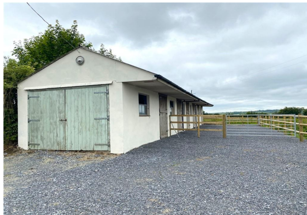
Stable Block And Hardstanding