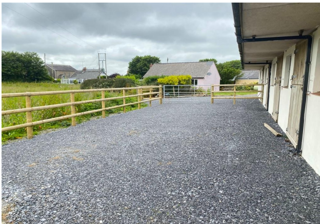
View Of Property From Stables