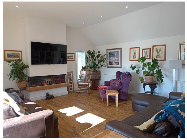
Large Feature Lounge

Google Co-ordinates: 52.114206, -4.512295