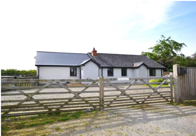
As You Arrive .....