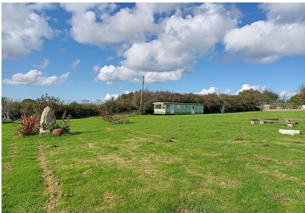
Large Lawned Grounds & Static Caravan