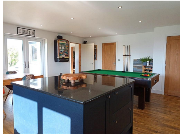
Kitchen / Diner View 2