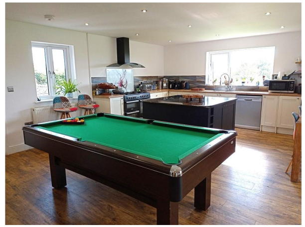
Kitchen / Diner View 1

Services: Mains electricity, mains water, private drainage (septic tank), LPG central heating.