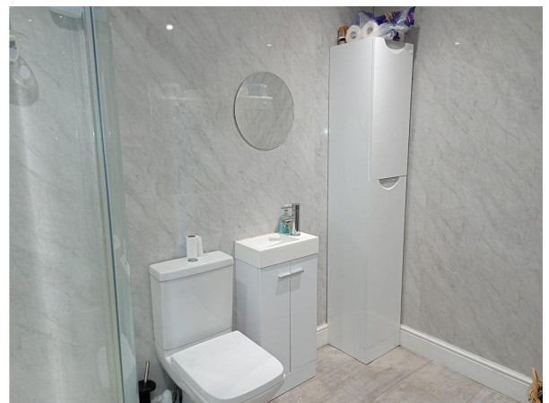
Shower Room 1