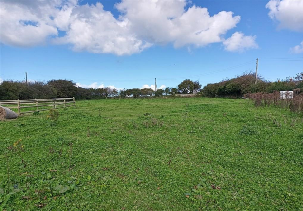
Paddock 1 - Other View