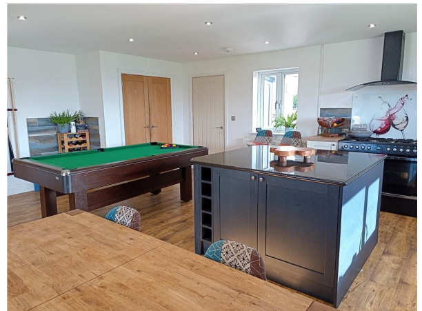
Kitchen / Diner View 3