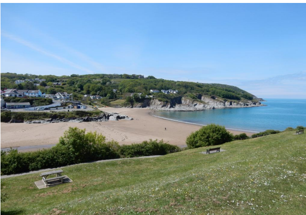
Close (about 2 miles) To Aberporth Beach