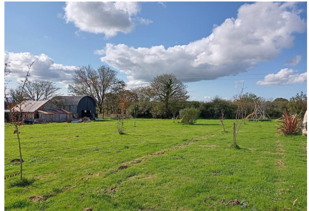
Large Lawned Grounds