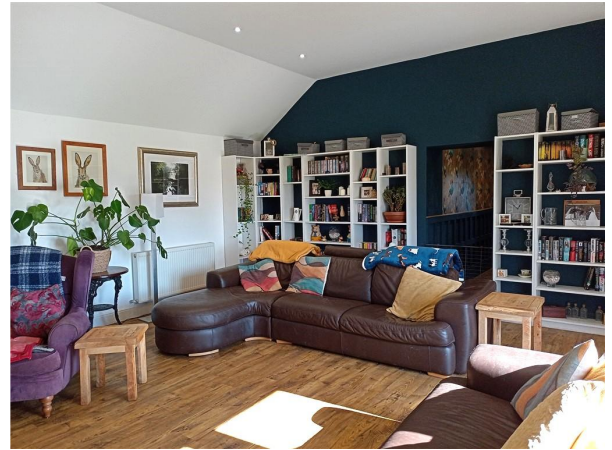
Feature Lounge - View 2