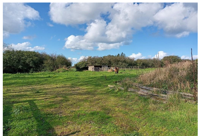
Field Shelter In Paddock 1