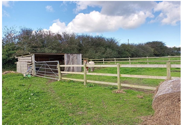
Field Shelter & Enclosure