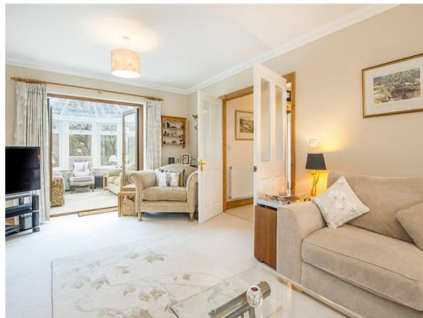
Lounge Another View