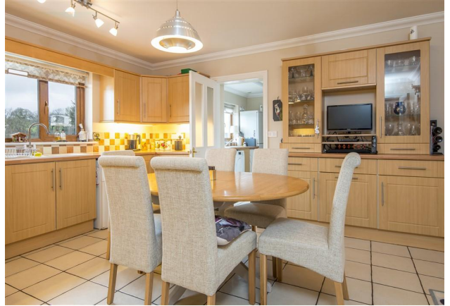
Kitchen / Breakfast Room