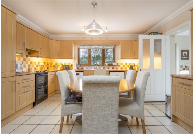
Kitchen / Breakfast Room