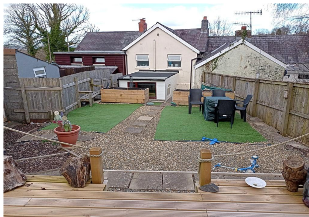
View Looking Back To House