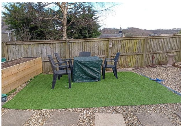
Seating Area In Rear Gardens