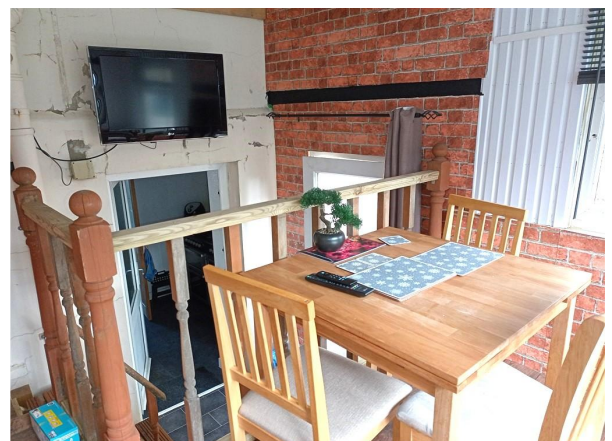
TV / Hobby Room