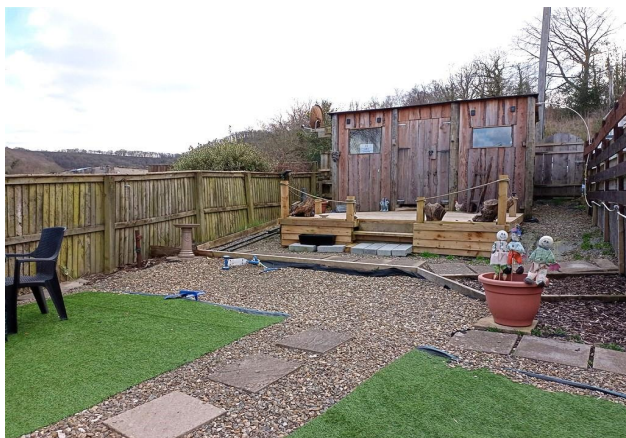
Rear Gardens & Bar