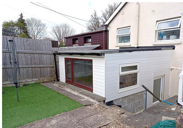
Outside View Of TV/Hobby Room