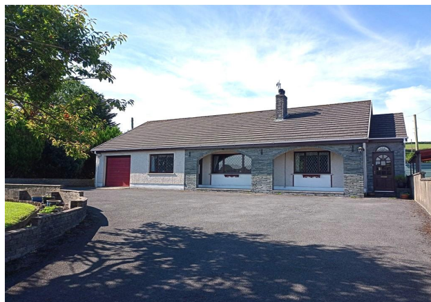
Main View Showing Parking Space