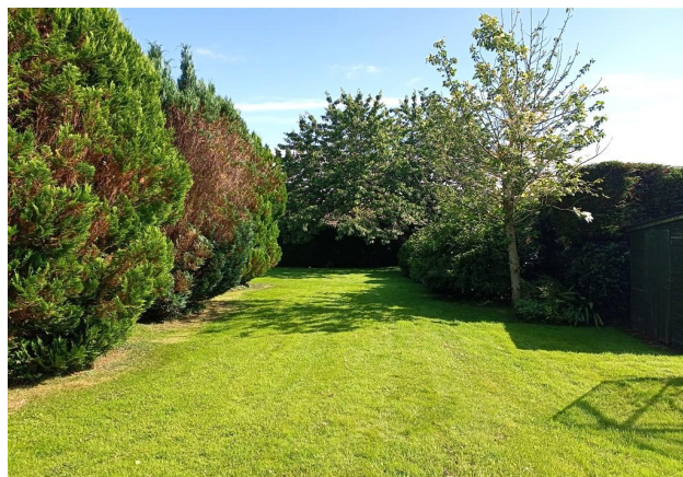
Side Lawns - View 2