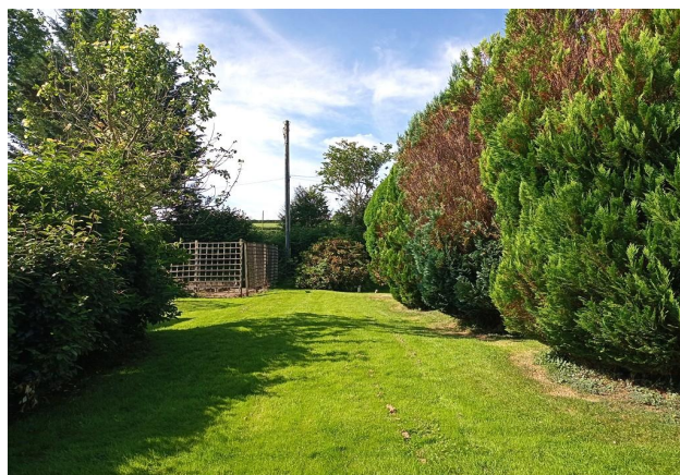
Side Lawned Gardens