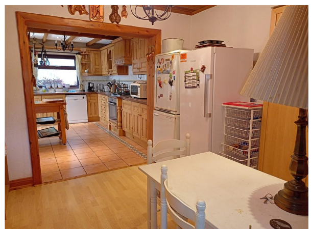
Kitchen / Breakfast Room