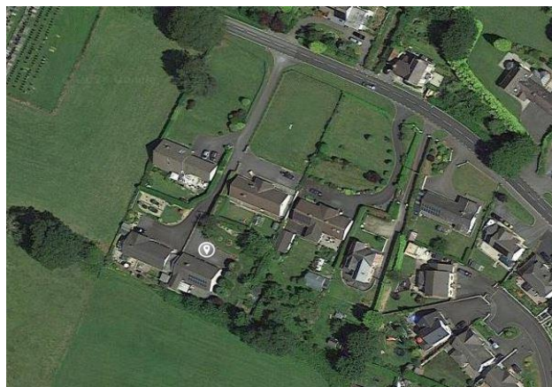
Aerial View Showing Location Pin