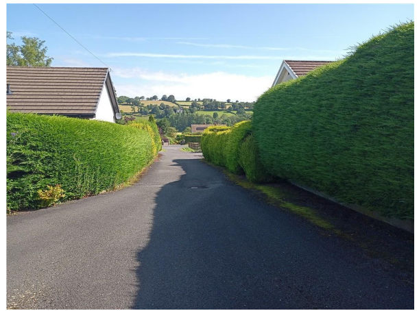
90m From The Main Roadway

Externally - Entrance via galvanized gates leading onto a spacious tarmac driveway/parking area and providing access to the garage. There are attractive lawned areas to the front and side with raised bedding