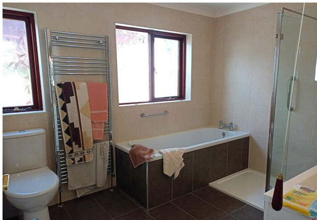
Family Bathroom 1