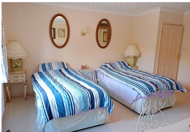
Master Bedroom -View 2