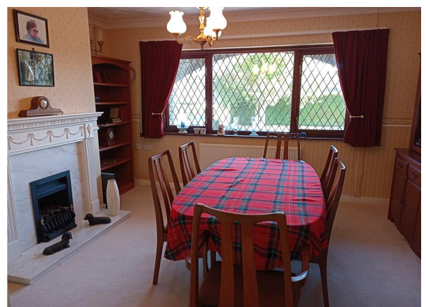
Bedroom 1 / Dining Room