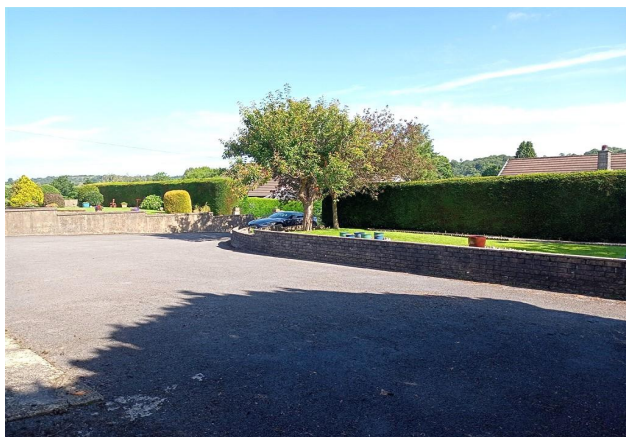
Extensive Parking To Front