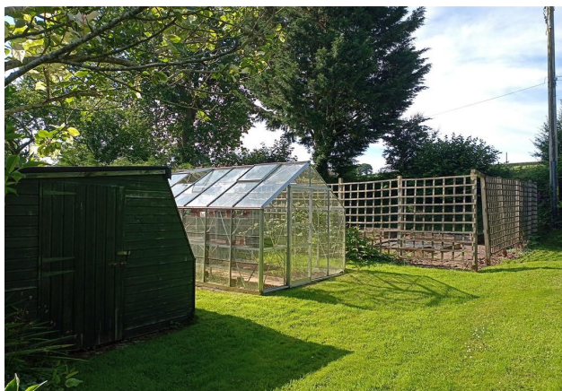
Shed, Greenhouse And Raised Beds