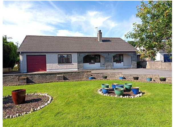
Main View 1