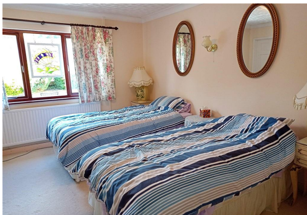
Master Bedroom 3 (Ensuite)