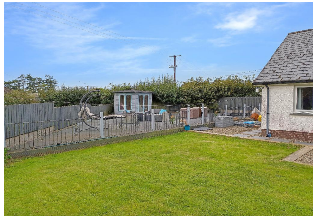
Lawns and Decked Area