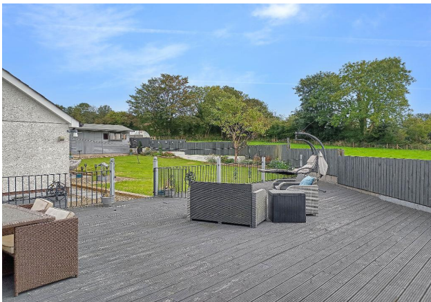
Open Aspect over Fields