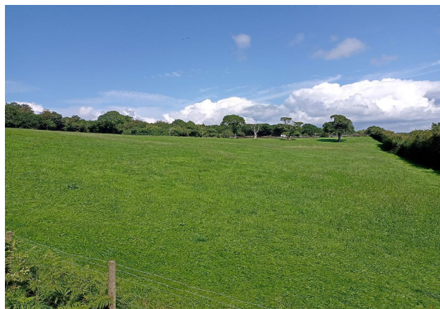
View From Bedroom 1