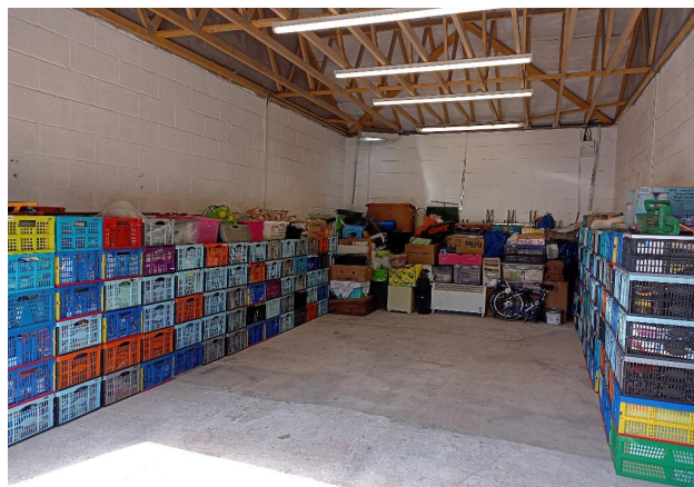
Garage - Inside View