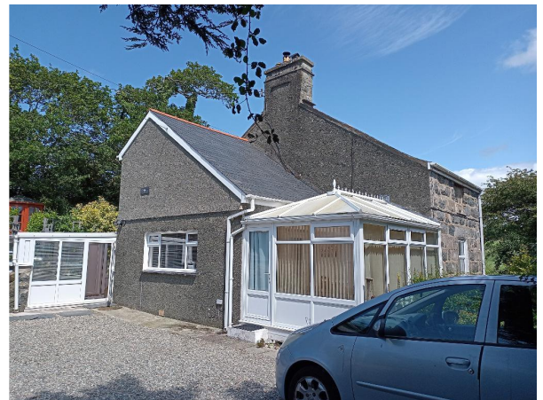
Another Main View