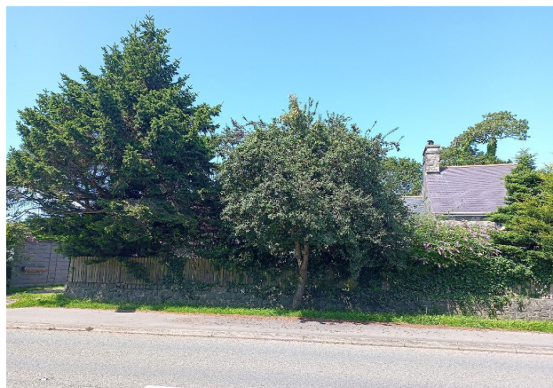
View from Roadway