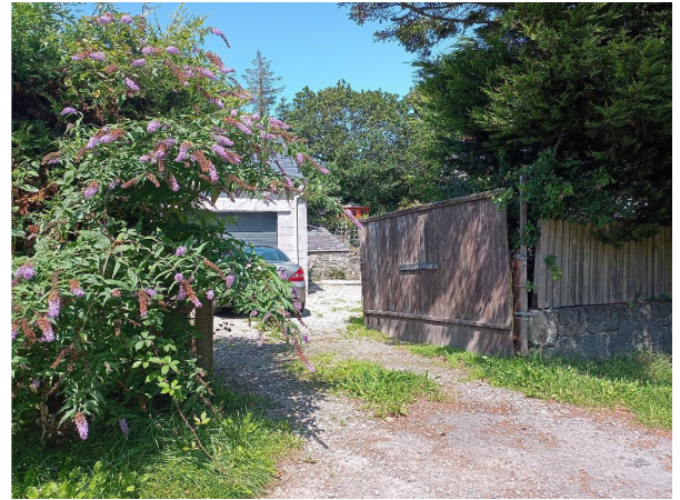
Entrance to Property