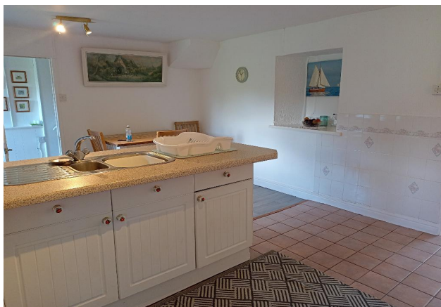
Kitchen / Diner - Another View