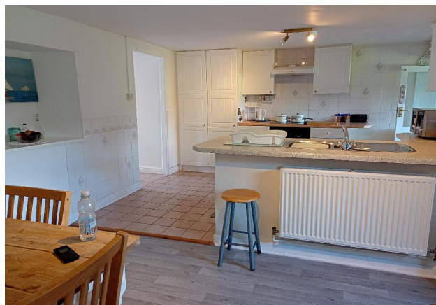
Kitchen / Diner - Another View