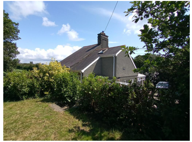
Main View 2

Bathroom - 8' 11" x 5' 10" (2.74m x 1.8m) With part-obscured double-glazed window to side, low level flush WC, panelled bath with shower over, wash hand basin set in vanity unit, laminate flooring, radiator.