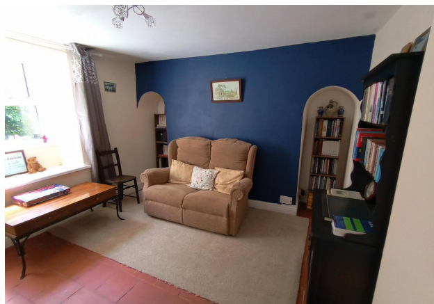
Sitting Room / Bedroom 3