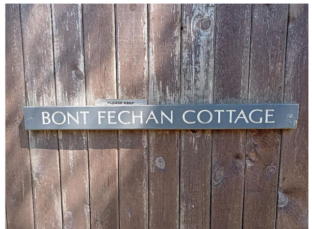
Bont Fechan Cottage Plaque