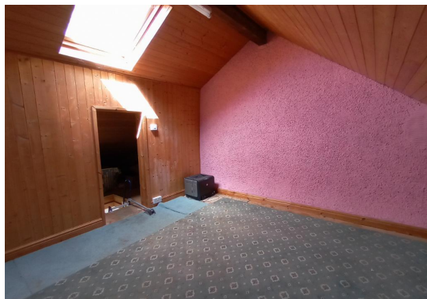
Loft Room - Another View