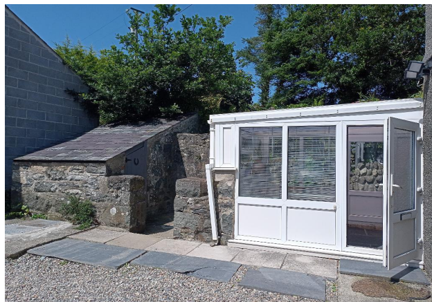
Sun Room and Outside WC