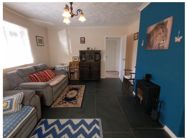
Lounge - Another View