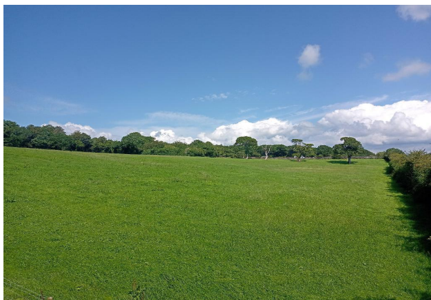
View From Bedroom 2