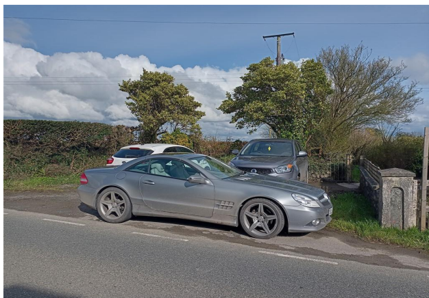
Off Street Parking Area