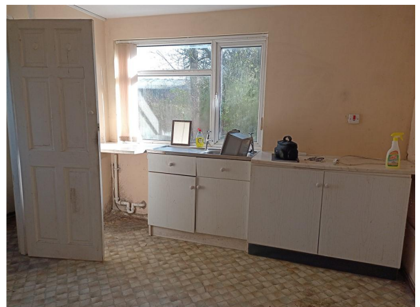
Utility / Shower Room