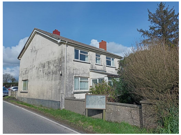
Main View 2

JAPANESE KNOTWEED - Please note: We are advised by our client (not seen by ourselves) that there is some Japanese Knotweed in the garden of this property. Our client has obtained a recent quote from a company that deals with its eradication.