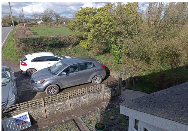
View Over Parking Area