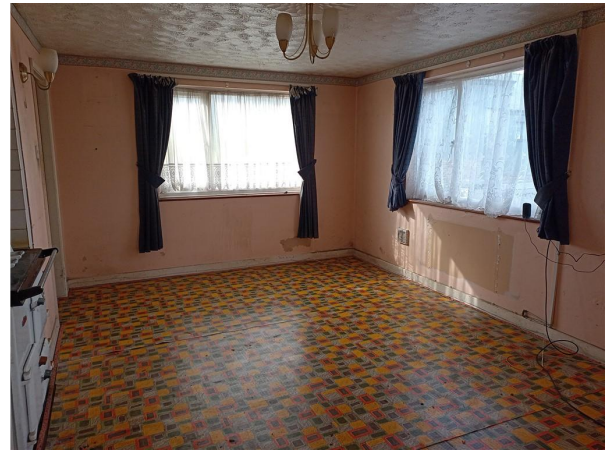
Dining / Sitting Room