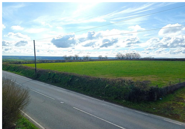
View From Bedroom