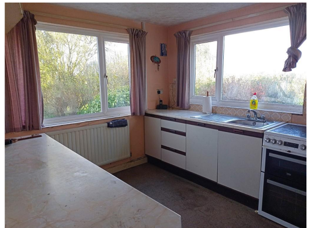
Kitchen View 2