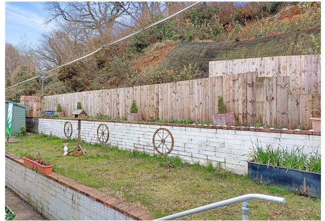
Garden Area to Rear