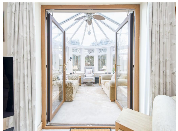
View Into Conservatory