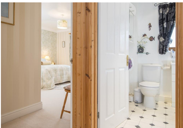
Bedroom 2 & Family Bathroom