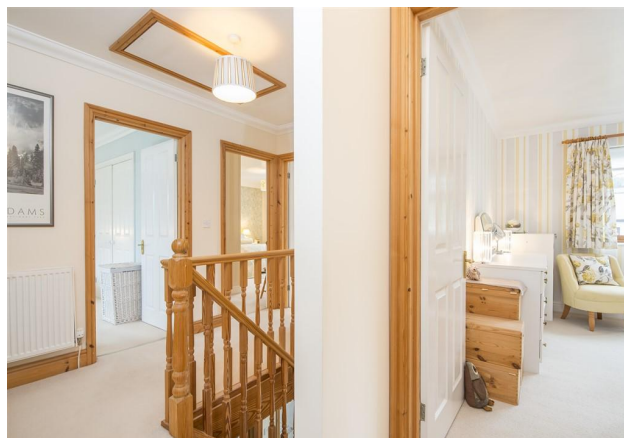
Landing Area & Bedroom 4