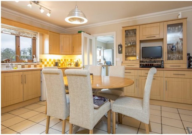
Kitchen / Breakfast Room