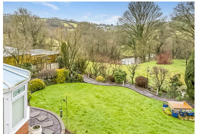
River View From Rear Bedrooms