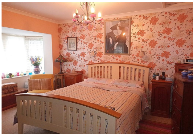
Master Bedroom (ensuite)