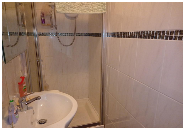
Master Ensuite Shower Room