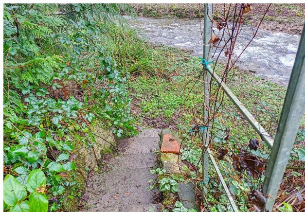
Steps Down To River Esgair