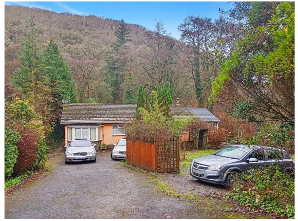
Main View 2

Directions - From Newcastle Emlyn, take the A484 towards Carmarthen. In the village of Pentrecagal, turn right towards Drefach Felindre. Proceed into the village, proceeding over the narrow bridge and continue, proceed past the turning to Penboyr & Drefelin and continue. Pass a property "Llys Deri" on the right and Pant y Deri is the next