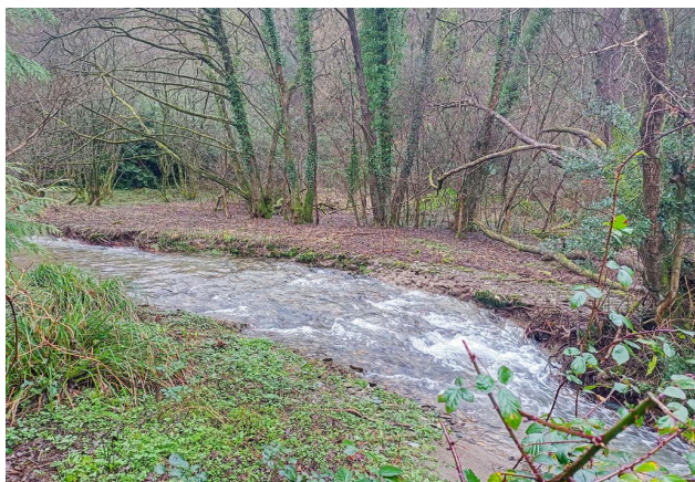
River Esgair To The Rear