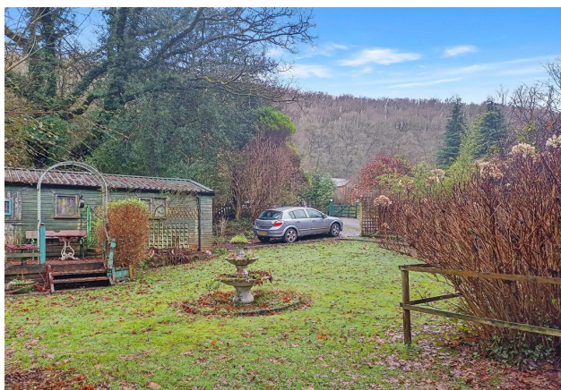
Wooded Valley Location