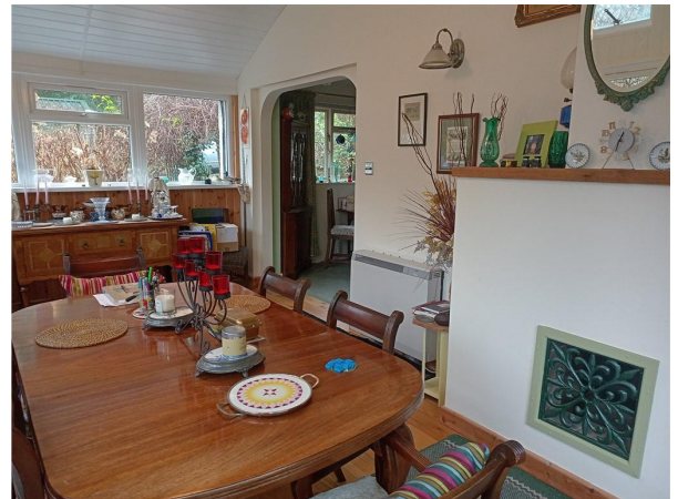
Dining Room-View 2