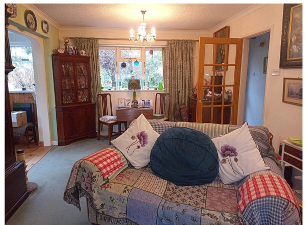
Other View Of Lounge/Diner