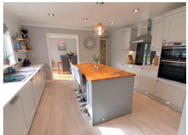
Kitchen / Breakfast Room