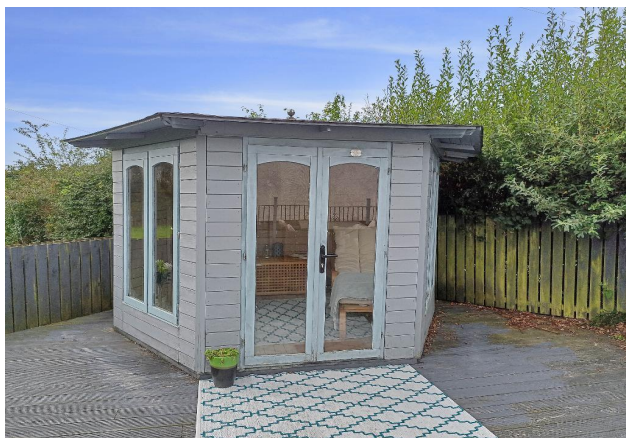
Small Summer House