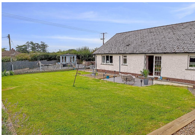
Rear Lawned Area