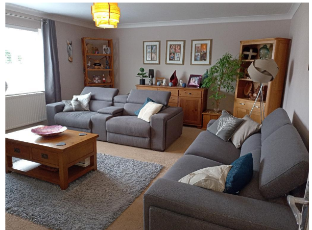
Lounge - Another View