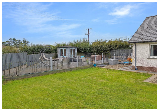
Lawns and Decked Area