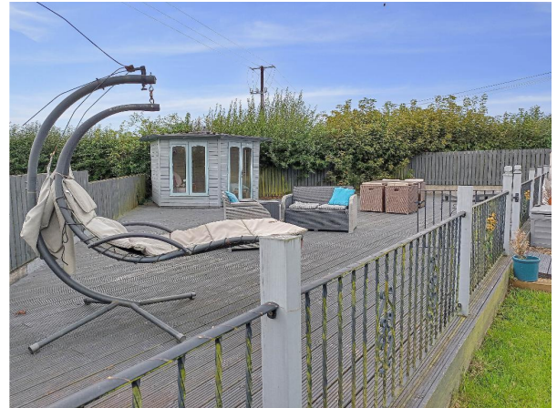
Large Decked Area