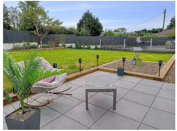
Attractive Patio Area

General Information - Viewings: Strictly by appointment with the agents, The Smallholding Centre or our sister company, Houses For Sale