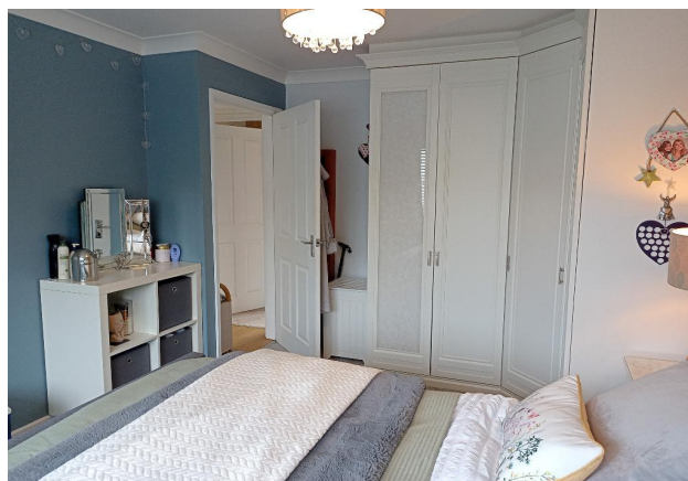
Bedroom 3 - Another View