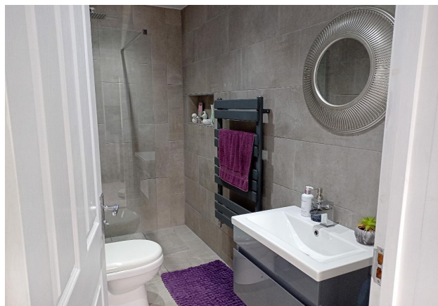
Shower / Wet Room