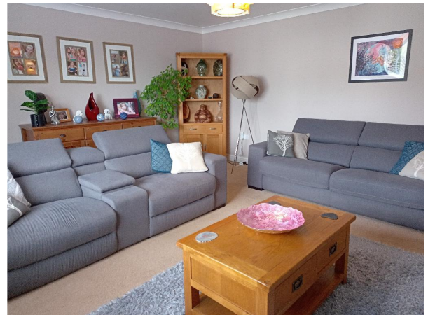
Lounge - Another View