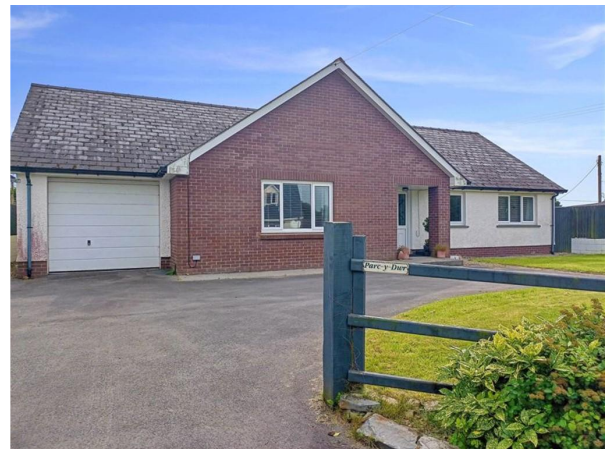
Main View 2