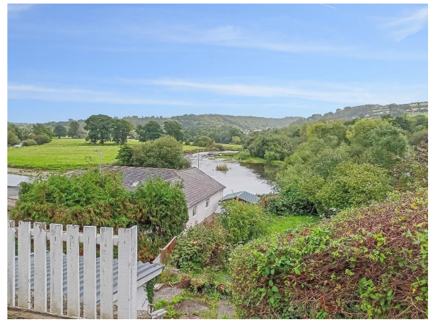
View from Rear Decking

POSSIBLE 5 YEAR MINIMUM TENANCY - Our clients MAY consider