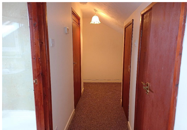
Second Floor Landing