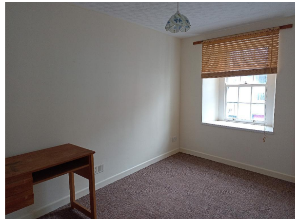
Flat Bedroom 1