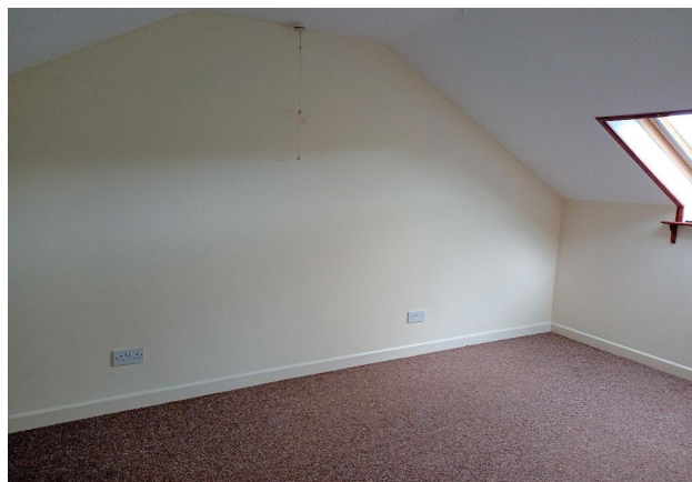
Second Floor Master Bedroom