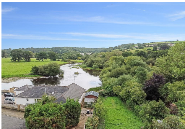
View From Second Floor