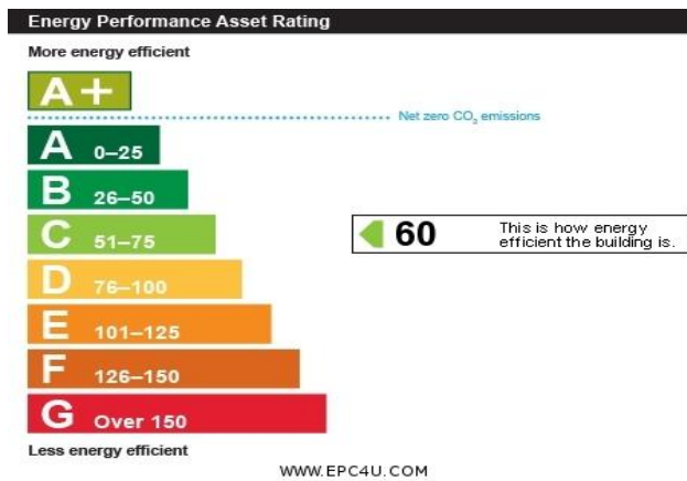
Commercial EPC for Ground Floor