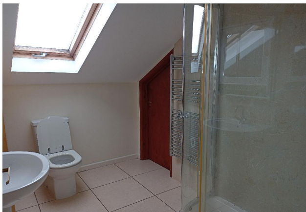
Second Floor Shower Room