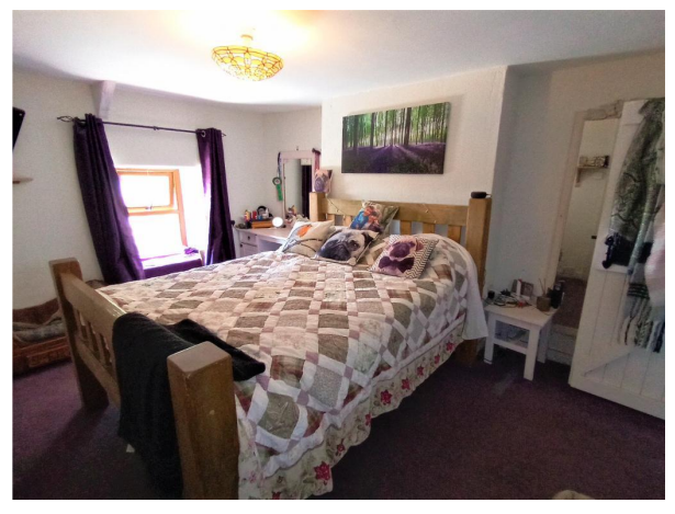
House Master Bedroom