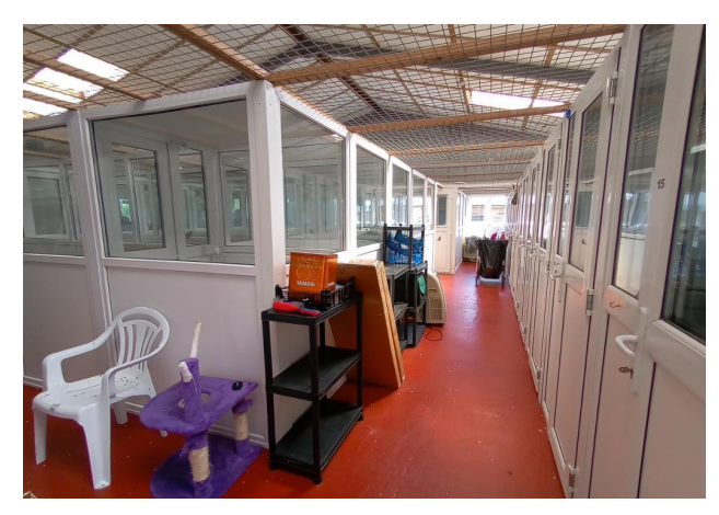
Inside View 4