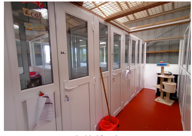
Inside View 2