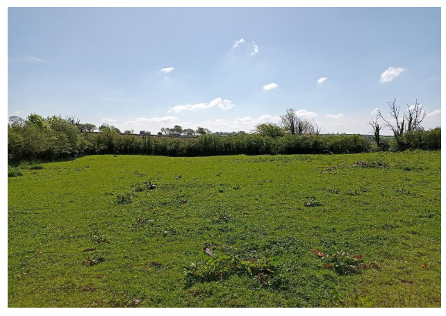
Paddock 1 Near House