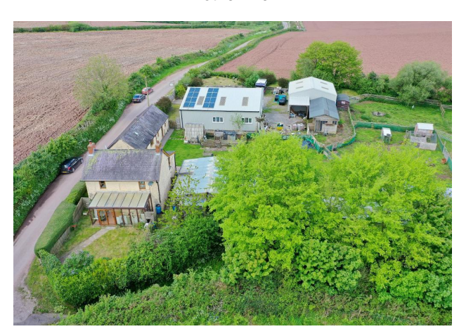
Aerial View 4