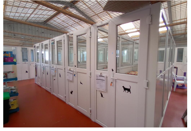
Inside View 3