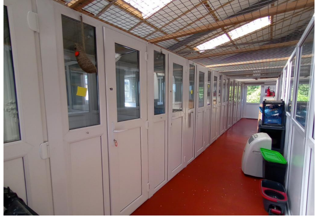
Inside View 1