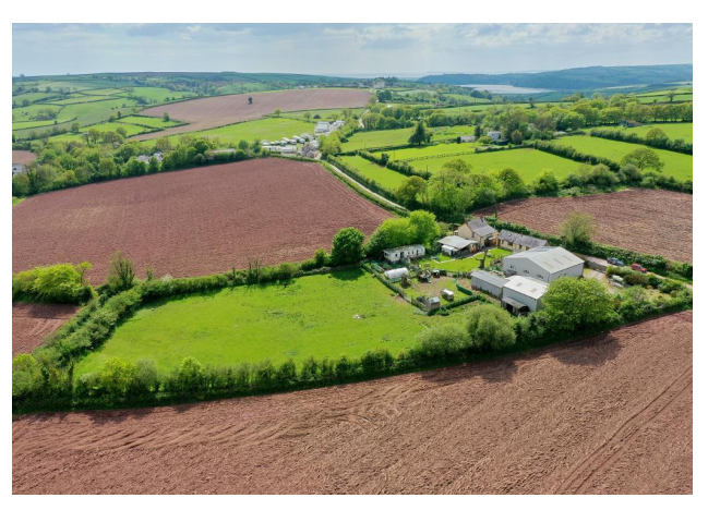
Aerial View 5