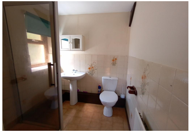
Annex Shower Room