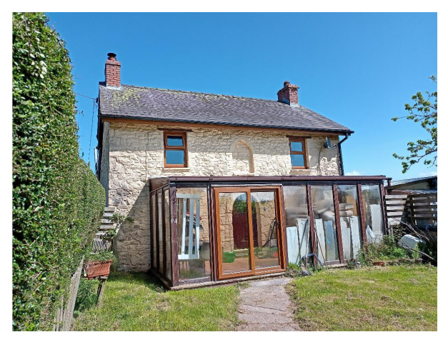
House Close Up