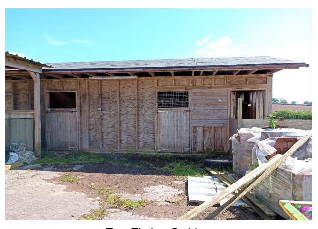
Two Timber Stables