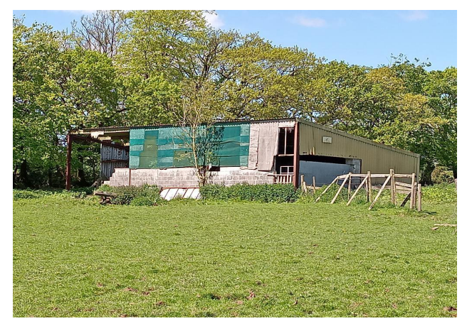
Large Field Shelter