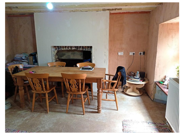
House Dining Room