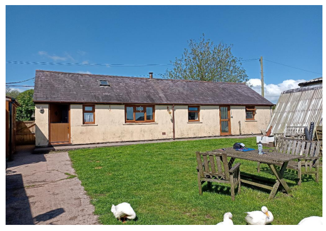
Outbuilding With Annex